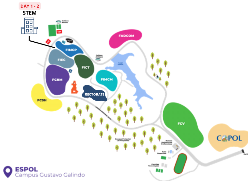
Map of the venue

ESPOL is located in Guayaquil, Ecuador at Gustavo Galindo Velasco Campus, Km 30.5 Perimetral Road. ESPOL will provide means to transport you from the hotel to ESPOL and viceversa. The event will be hosted at the Rectorate and STEM buildings.